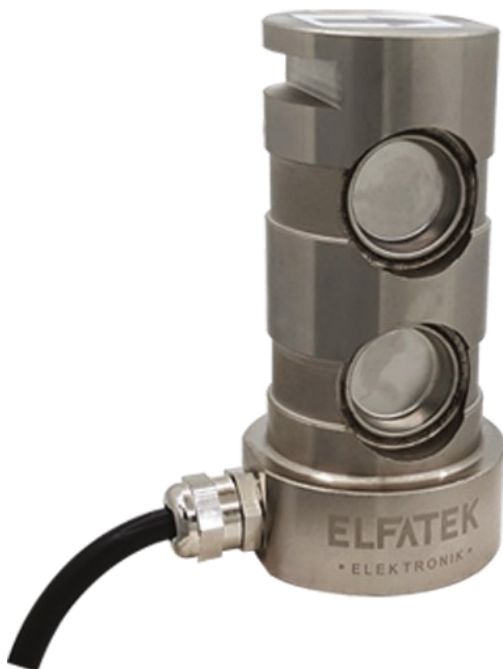
Load Cell Pin Type