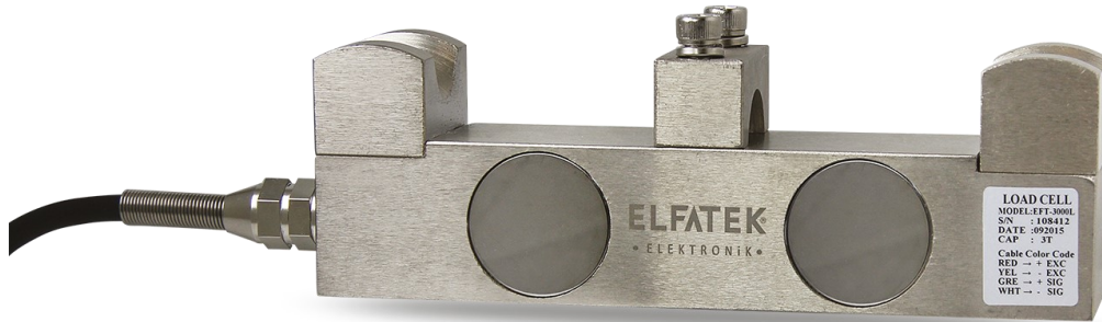
Load Cell Rope Type